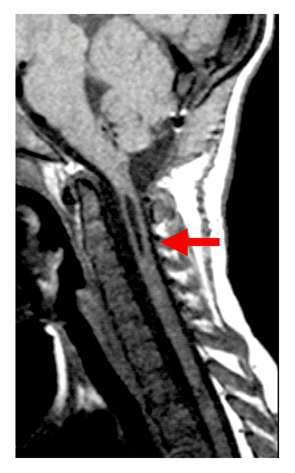
Figure 4. This sagittal MR image represents the same patient depicted in Figure 2 after surgical treatment. In this sequence the CSF is black. The red arrow marks the syrinx cavity that was distended in Figure 2. Now it is collapsed; it no longer widens the silhouette of the spinal cord.

Even if it successfully relieves all symptoms, surgical treatment for the CM1 should not be considered a cure, especially if there is associated syringomyelia. The long-term outlook for treated patients is really not known. Periodic neurosurgical reassessment and, at the surgeon's discretion, periodic MR imaging are appropriate to monitor for complications.