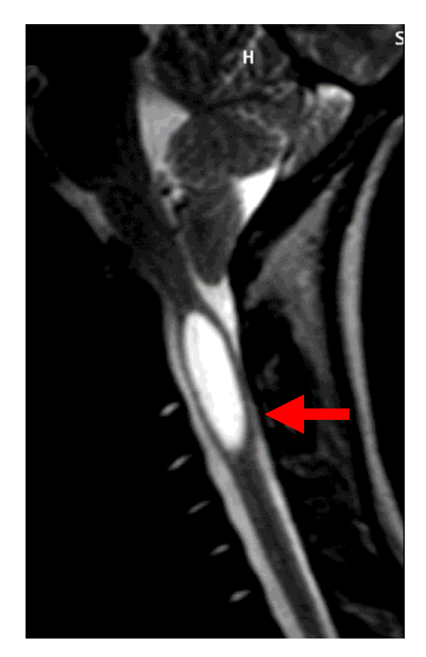
Figure 2. This sagittal MR imaging view of the CM1 shows the same portion of the skull and cervical spine as Figure 1. The CSF is light gray or white in this imaging sequence. The red arrow marks a distended syrinx cavity that widens the silhouette of the spinal cord.

The CM1 is the result of a developmental aberration, so in most instances it is present at birth. Syringomyelia, on the other hand, is acquired later in life, and to understand how the CM1 causes the appearance of syringomyelia requires an explanation of the physiology of cerebrospinal fluid (CSF). CSF is the salt-water solution in which the brain and spinal cord float. It is contained by a thin, tough membrane, called the "dura," that lines the spinal canal and the inner aspect of the skull. The brain produces CSF within internal cavities, called "ventricles," and after it has flowed out of the ventricular system and has bathed the brain and spinal cord, CSF is recycled into the venous side of the circulation. CSF is in constant motion. Not only is it flowing slowly from the site of its secretion to the site of its recycling, but it also pulsates in a to-and-fro manner with each heart beat.